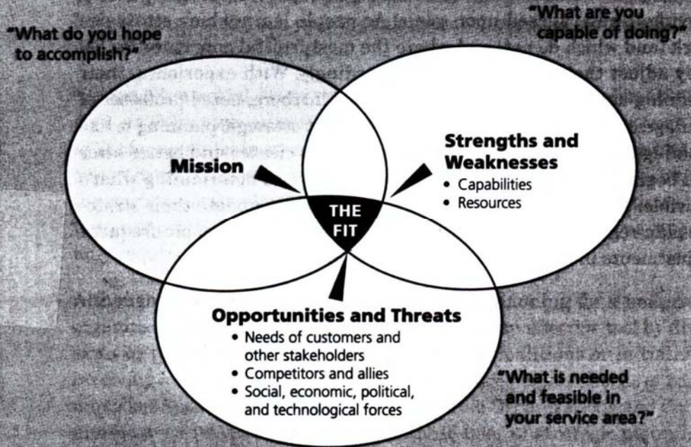
Figure 2: Finding the Fit